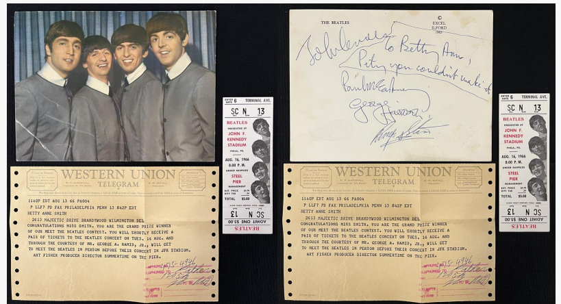
Telegram of congratulations sent to the consignor, informing her she'd won a ticket (included) to see the Beatles at their Steel Pier (Philadelphia) concert in August 1966 (est. $15,000-$20,000).