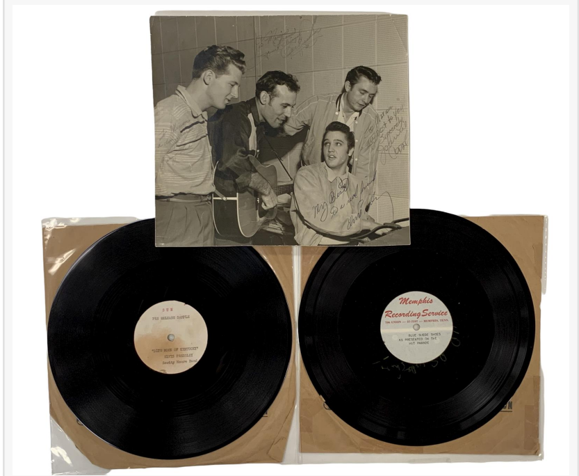
Items pertaining to Elvis Presley's early career at Sun Records, including one of three original master recordings from his first-ever recording session in 1954, a Holy Grail Elvis collectible.