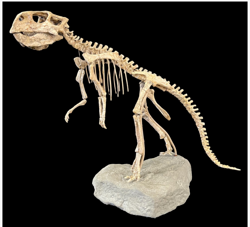
Full Psittacosaurus dinosaur skeleton, existing between 126 and 101 million years ago in Asia, 18 inches tall and 24 inches long, professionally repaired and restored (est. $15,000-$25,000).

More on that later. First, the original "Los Angeles Consolidated Booking Form Jail Custody Record" with Charles Manson's thumbprints, created when Manson was first booked for robbery and homicide in the horrific Tate-LaBianca murders in 1969. Manson was already being held on car theft charges when detectives were dispatched to arrest him following his murder indictment.