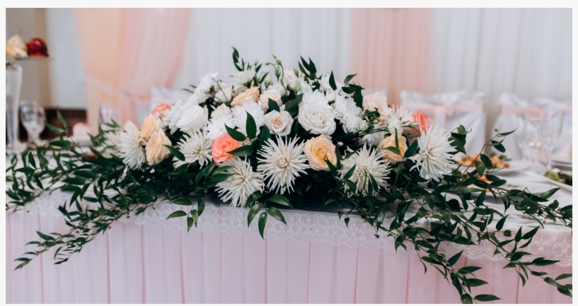
Reds Roadhouse - The Best Party Event Venue In Dallas Fort Worth

2022 has been an excellent year for the wedding and party industry. The impact of the last two