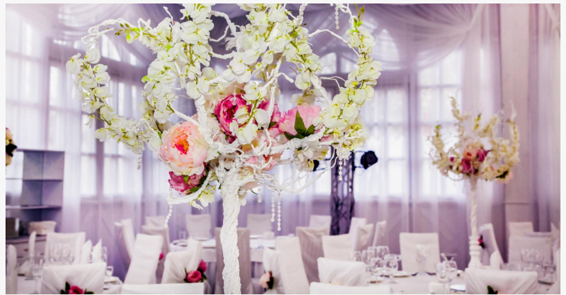
Party Event Venue In Dallas