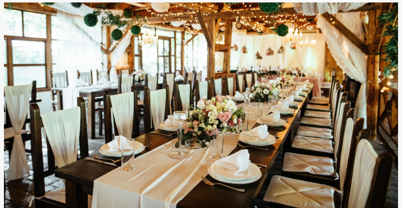
Best Party Event Venue In Dallas Fort Worth, Texas