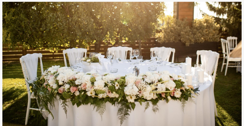
Best Party Event Venue In Dallas Fort Worth