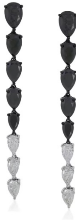
5.55 ct. t.w. Black and White Diamond Drop Earrings in 18kt White Gold