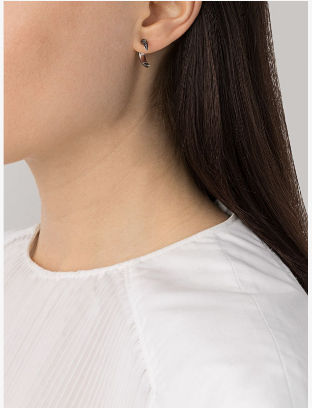
Shaun Leane 18kt white gold small Talon black diamond earrings

Ankur Gandhi GDESIGN LLC +1 713-239-0897 email us here