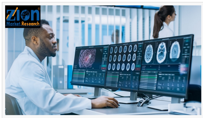
Global Teleradiology Market Size and Share

SUITE N202, NEW YORK, UNITED STATES, September 12, 2022 /EINPresswire.com/ -- Global Teleradiology Market Business Module Analysis Consist of a Methodology overview including Primary Research, Secondary Research, Company Share