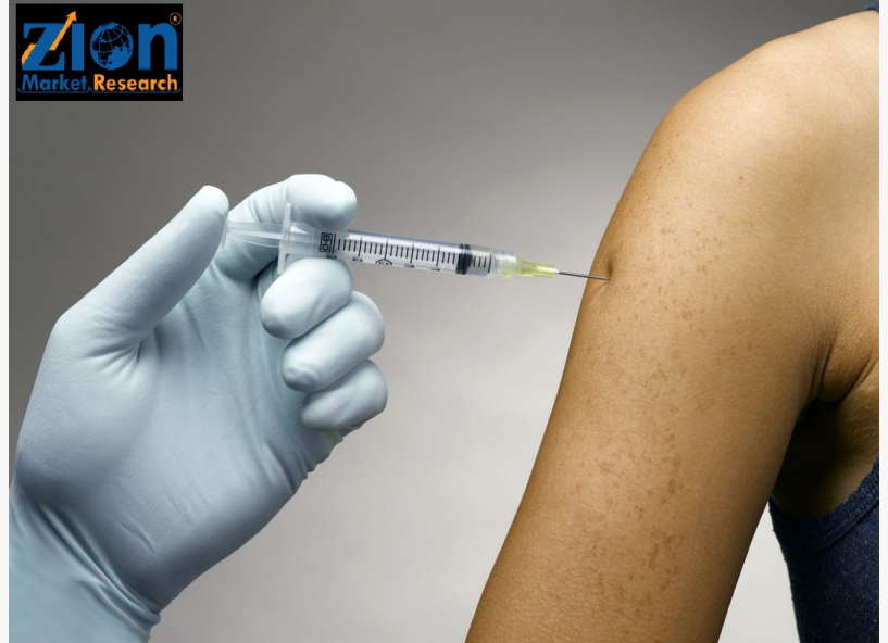
Global Therapeutic Vaccines Market

Global Therapeutic Vaccines Market Report provides an overview of upcoming and current market trends, as well as a perspective on key segments. Our organization addresses all of the necessary aspects for your Research Study. The market research includes historical and projected market data, Size, Share, Demand, Growth Analysis, application specifics, price, trends, and company