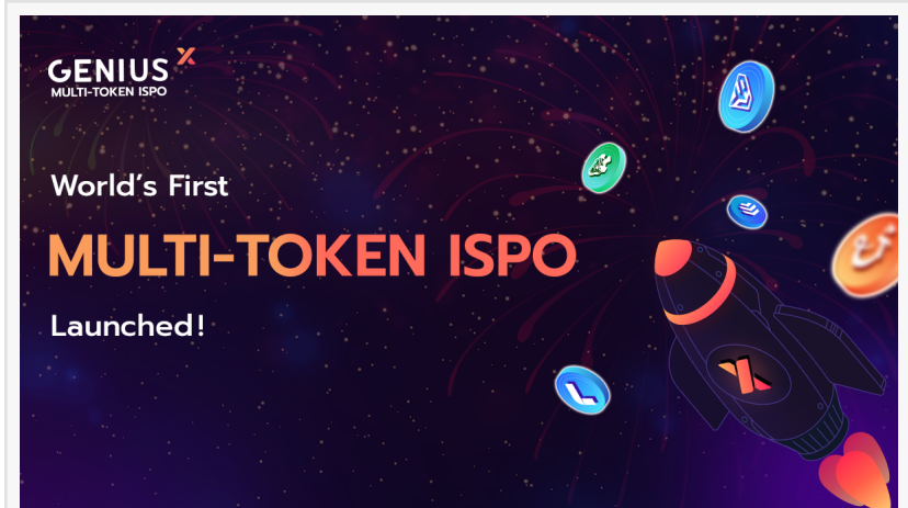
Multi-Token ISPO by Genius X is LIVE!

In an ISPO, delegators stake their ADA tokens to a Cardano stake pool run by a startup. Delegators give up their usual ~ 4-5% APY, or annual returns, in ADA staking rewards in exchange for receiving a project's native tokens. These are utility tokens, which will be used for activities on the platform such as governance, staking, or interacting with the project's application. Startups use the ADA staking rewards to fund development for their new venture. Cardano ISPOs have become one of the most egalitarian mechanisms for startups to raise funds from Cardano's growing 3.5+ million community.