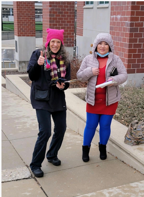
Field Team 6 volunteers rejoice after registering a voter in Wisconsin.

This press release can be viewed online at: https://www.einpresswire.com/article/590492317 EIN Presswire's priority is source transparency. We do not allow opaque clients, and our editors try to be careful about weeding out false and misleading content. As a user, if you see something