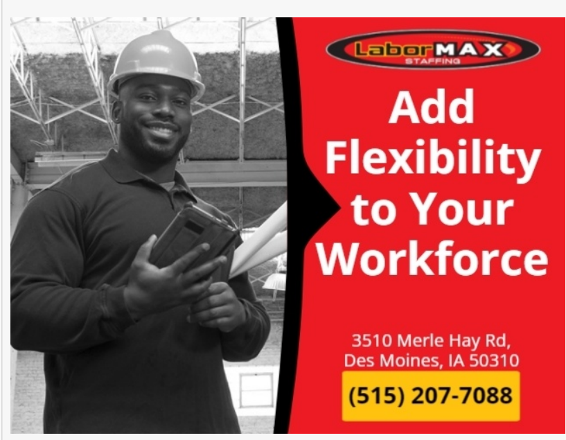
Recruiter in Des Moines