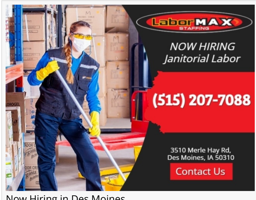
Now Hiring in Des Moines

One can even simulate hypothetical safety scenarios, while updating safety procedures promptly after employees report any safety issues. Industry