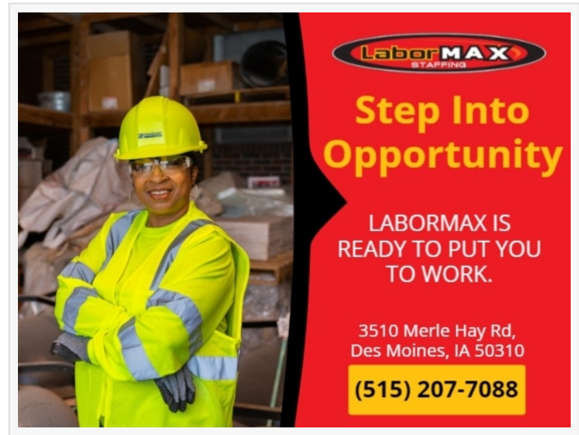
Staffing Agency in Des Moines