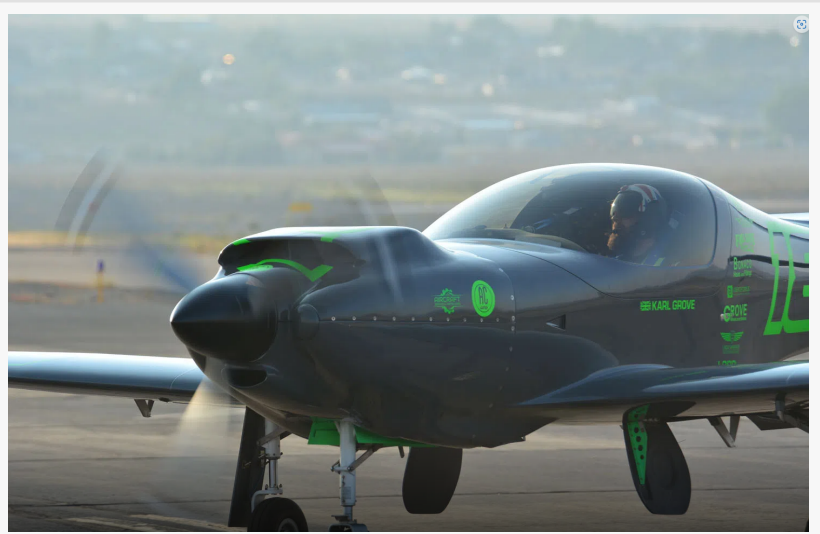
Grove Aero Sport Racer

MONTGOMERY, ALA., USA, September 12, 2022 /EINPresswire.com/ -- Hartzell Engine Tech induction air charging systems by AeroForce and Jasco alternators and voltage regulators will be firewall forward at the upcoming Reno Air Racing Association's Stihl National Championship Air Races Sept. 14-18. The engine accessory company is sponsoring two race teams, Grove Aero Sport and Honda Generators 90 Race Team.