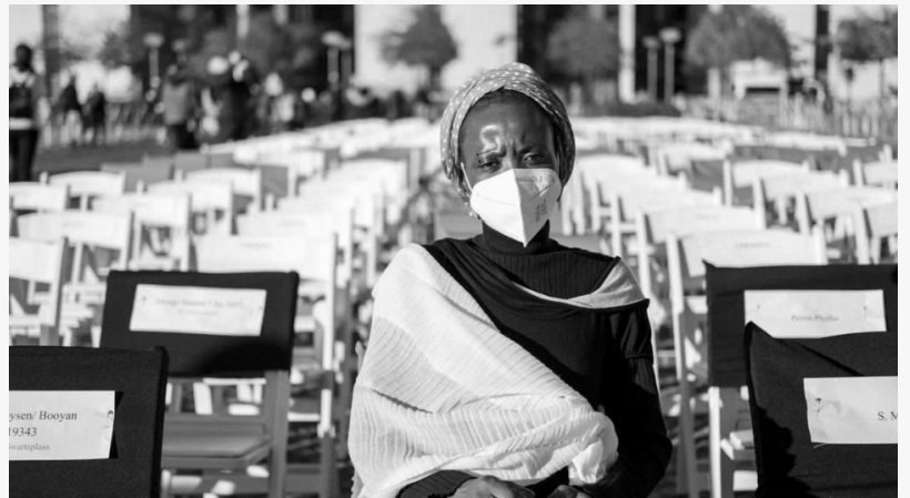
She's the living monument of the Afrakan Colonia Soldiers of world wars.