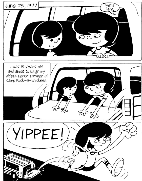
Glick arrives at camp