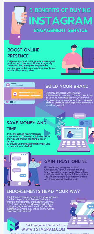
Benefit Using Fstagram