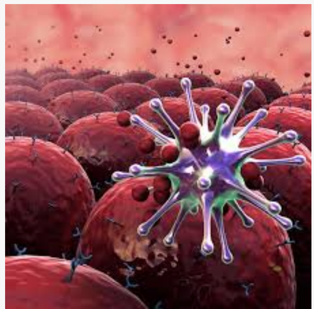
Bladder Cancer Therapeutics Market Share