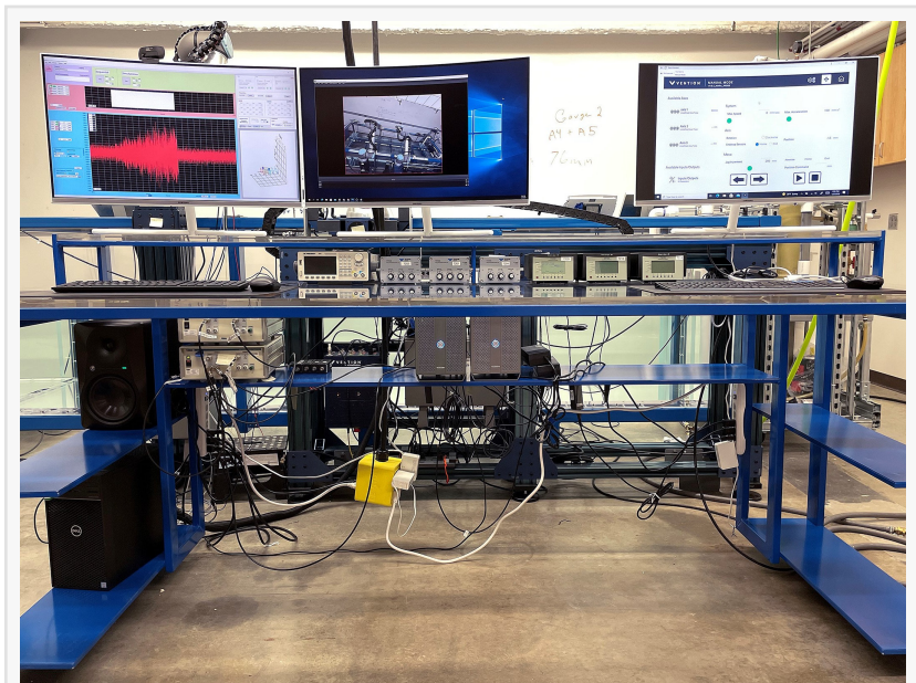
The control console with the two grey PCIe chassis in the middle

This scaled experiment requires much higher frequencies in the kilohertz range, than would be used in the ocean. The digitizers and AWG cards have a high resolution of 16-bit and can even sample and output at rates of 40 Megasamples per second respectively, while the skew between channels is less than 100 pico-seconds. That delivers the high precision required for the experiments. The two UR10e robot arms, along with the signal generation and the data