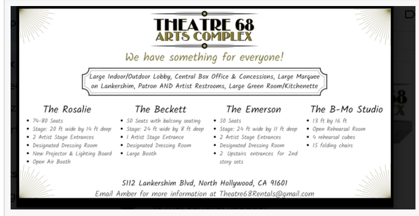
Theatre 68 Arts Complex - Something for everyone!

Theatre 68 is reopening its doors on September 17th in North Hollywood and now it's bigger and better than ever! Renamed and fully remodeled, THEATRE 68 ARTS COMPLEX will open the new venue with the critically acclaimed one man show, "I'm Not A Comedian...I'm Lenny Bruce" written and performed by Ronnie Marmo and