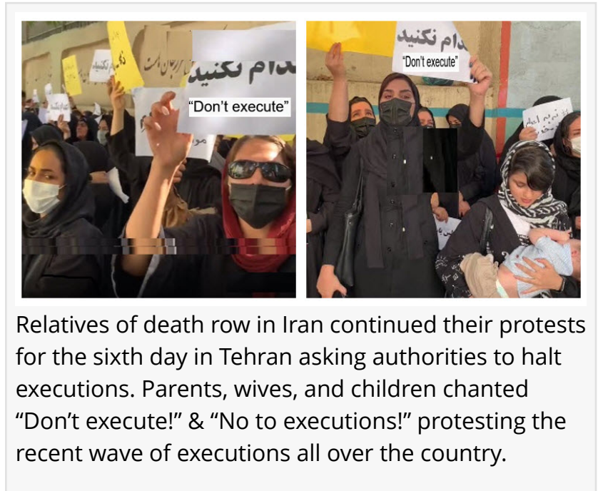
Relatives of death row in Iran continued their protests for the sixth day in Tehran asking authorities to halt executions. Parents, wives, and children chanted "Don't execute!" & "No to executions!" protesting the recent wave of executions all over the country.

Mothers, fathers, wives, and children of inmates sentenced to death held placards and chanted "Don't execute!" and "No to executions!" protesting the regime's recent wave of executions launched across the country.