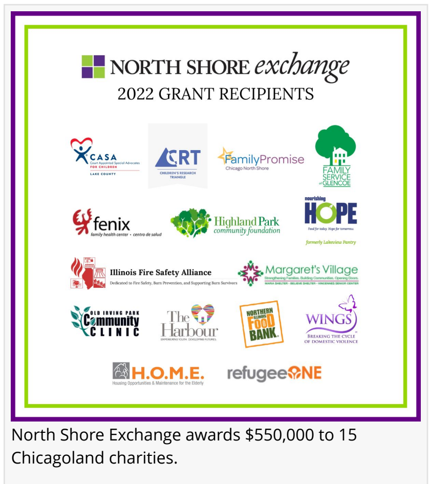
North Shore Exchange awards $550,000 to 15 Chicagoland charities.

Individuals can earn money by selling their designer and home goods on consignment. Once the items have been repurchased, these funds go back into the community in the form of grants