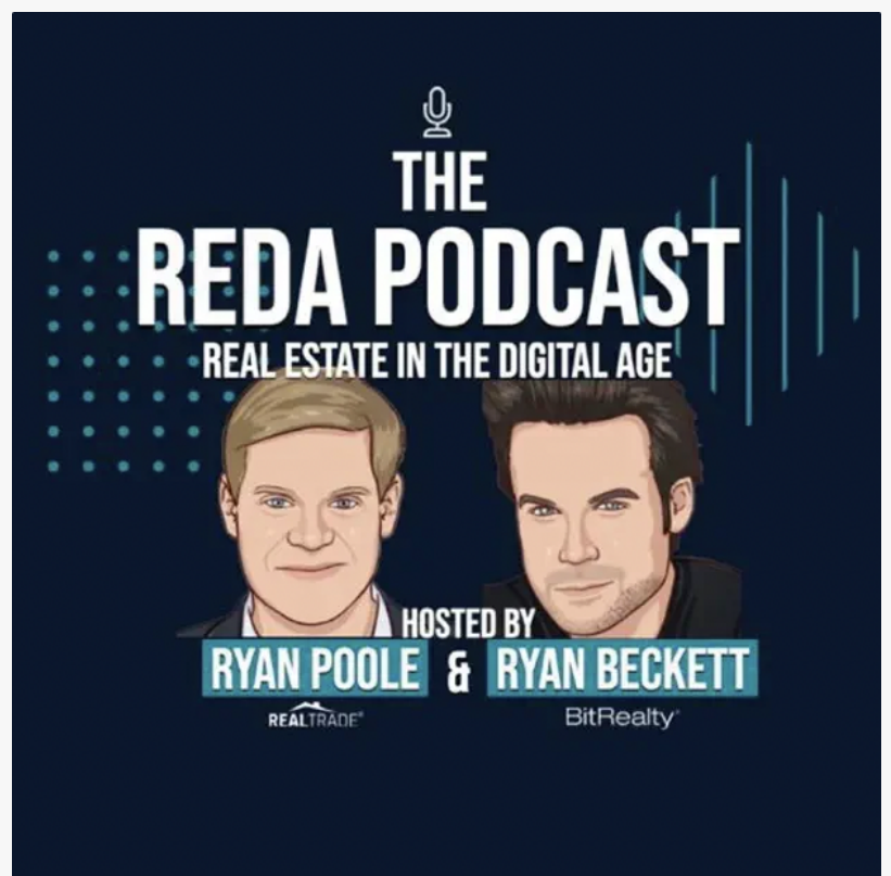
REDA Podcast - Real Estate in the Digital Age

The mission of the RealTrade real estate platform is to decentralize the real estate industry and give power back to real estate agents while taking it away from massive online industry giants. All members gain access to detailed property-based data so they can make educated,