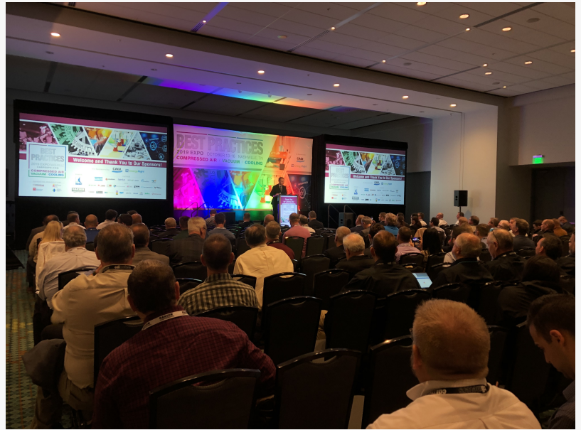
Rod Smith addresses attendees at the 2019 CABP Expo in Nashville

ATLANTA, GEORGIA, UNITED STATES, September 14, 2022 / EINPresswire.com/ -- The 4th Annual Compressed Air Best Practices ( CABP ) 2022 EXPO & Conference is scheduled for October 4 – 6, 2022, at the Cobb Galleria. This three-day event will bring together Sales Engineers and Manufacturing personnel interested in optimizing and maintaining on-site utilities powering automation - including compressed air, blower, vacuum, pneumatics and cooling water systems.