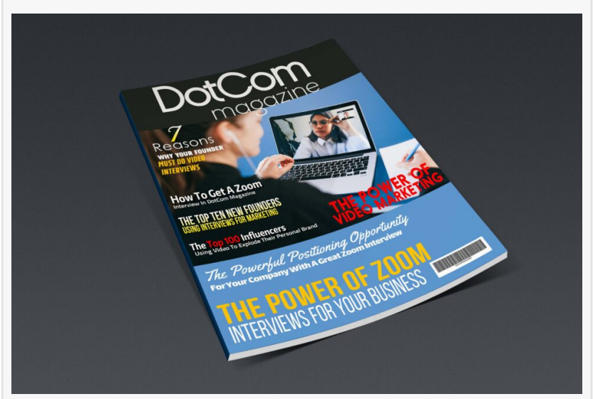
DotCom Magazine "The Zoom Interview Issue"