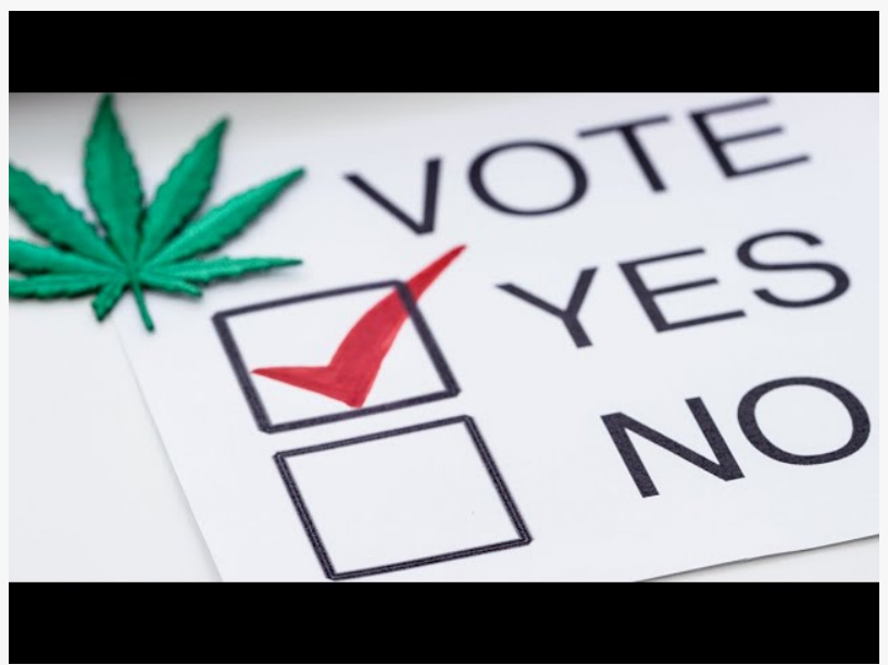
Vote Yes Ballot Committee in Kawkawlin Michigan via social media

Kawkawlin Township Council wisely authorized medical marijuana growing, transport and other business types for operation in the Township. The ballot proposal would expand the current authorization for medical-only businesses into authorization for the corresponding adult-use cannabis businesses. Township Council and the Planning Commission will still be in charge of crafting the rules under which the proposed businesses operate.