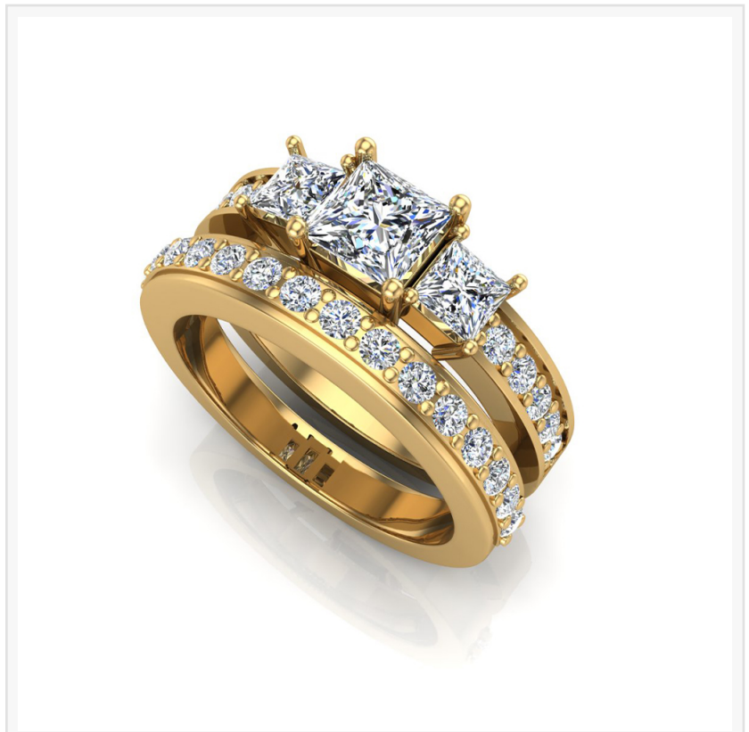
Past present future diamond engagement rings