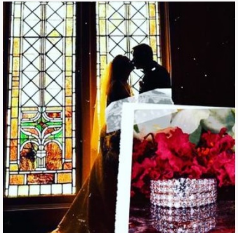
Diamonds are a symbol of Love