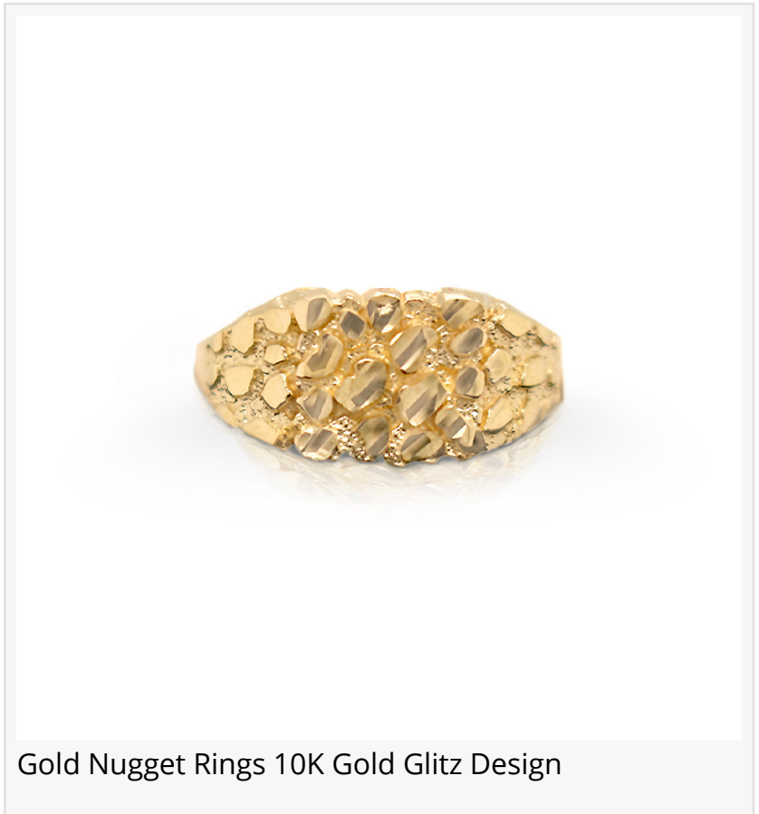
Gold Nugget Rings 10K Gold Glitz Design

Gold nugget rings have become a popular way to show off one's wealth in recent years. The Great Recession of 2008 led many people to invest in physical assets like gold and silver , instead of traditional items like stocks and bonds. And what better way to show off your newly acquired