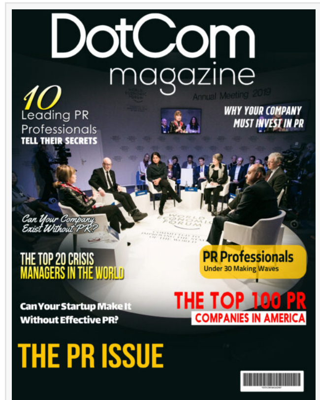
The DotCom Magazine PR Issue