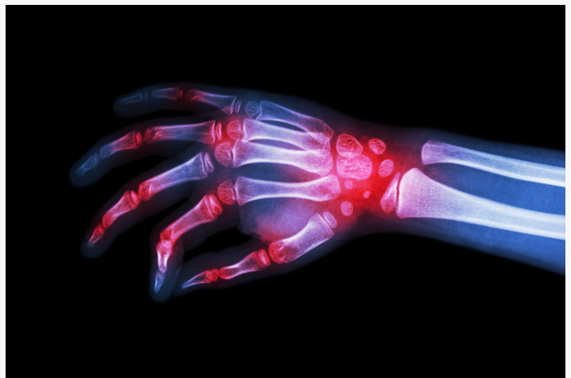
Global Psoriatic Arthritis Therapeutics Market

Global Psoriatic Arthritis Therapeutics Market & COVID-19 Impact Analysis, 2022-2030. The report provides a comprehensive analysis of the market, including an overview of the industry, a detailed analysis of the market segments, and a forecast of the market growth. The report also includes an analysis of the impact of COVID-19 on the market. The report is available for purchase at https://www.zionmarketresearch.com/sample/psoriatic-arthritis-therapeutics-market .