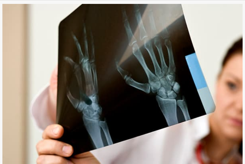
Global Psoriatic Arthritis Therapeutics Market

Psoriatic arthritis is caused by abnormal immune responses, which leads to joint inflammation and overproduction of skin cells. Psoriatic arthritis can affect any body part and cause swollen and painful joints that feel warm when touched. The global psoriatic arthritis therapeutics market is mainly driven by the increased prevalence of psoriasis that is leading to the rise in the number of psoriatic arthritis patients.