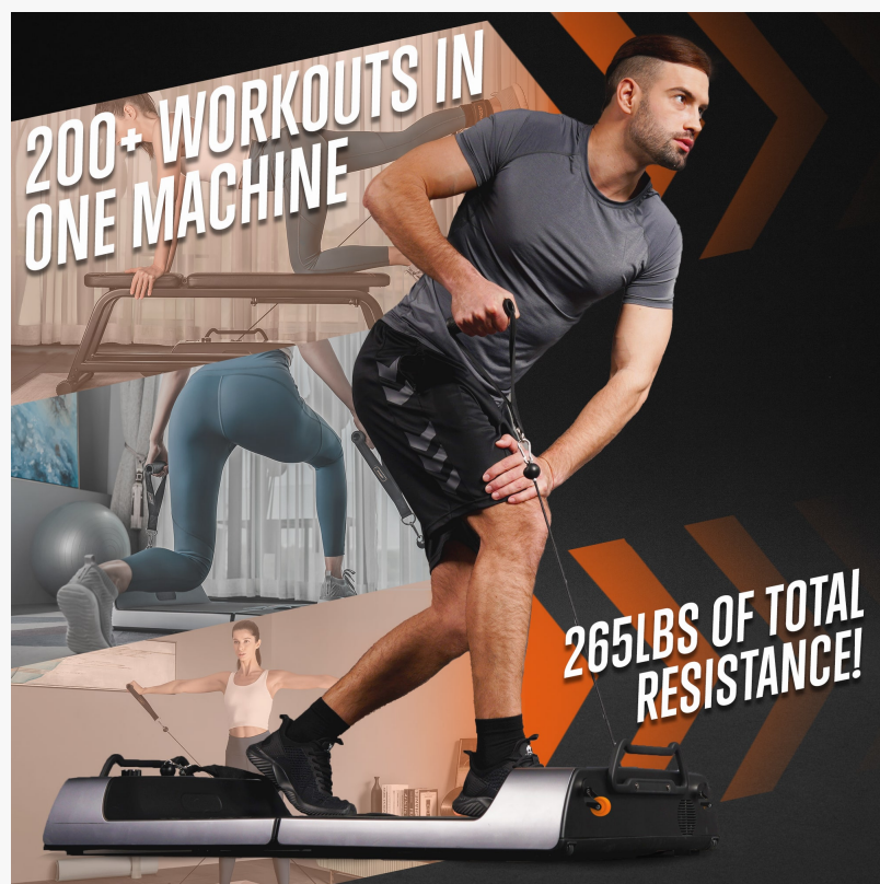
THE APOLLO - 265LBS OF TOTAL RESISTANCE

"Other competitors offer devices that are too cumbersome, require installation, occupy a great deal of space, offer limited training modes/features, or focus only on one type of training - not to mention their higher price tag. We beat them by offerings, size, price, technology, and service," reports Crowley.