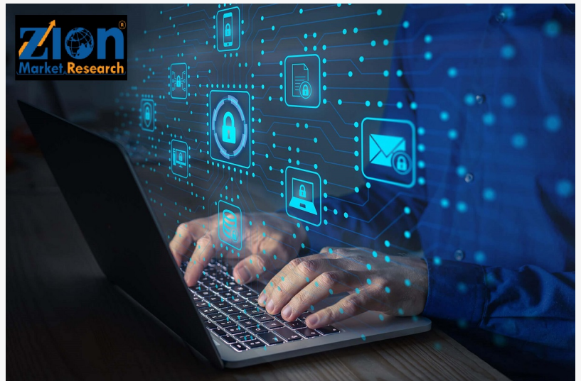
Global Cyber Security Market Trends and Technology