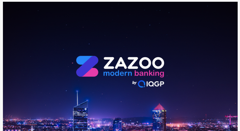
Zazoo by IQGP will be launching in the coming months

LIMASSOL, CYPRUS, September 19, 2022 /EINPresswire.com/ -- Zazoo , an innovative modern banking solution, is gearing up to launch in the coming months. According to IQGP, a payment technology company headquartered in Limassol, Cyprus, and developing Zazoo, the new banking solution is being built to accommodate the needs of remote teams and address the challenges of the gig economy.