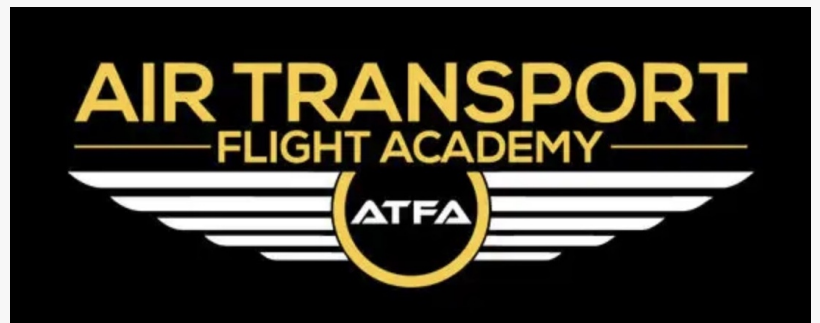
The 501c3 public charity

high cost of training them has lead to the formation of the non-profit "Air Transport Flight Academy" which has been approved by the IRS aa a 501C3 public charity.