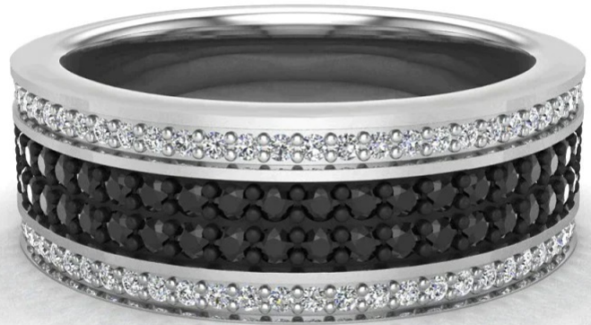
Mens Diamond Wedding Bands Glitz Design