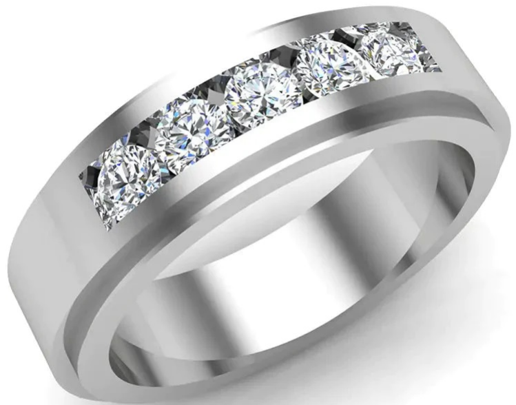
Mens Wedding Bands Diamond Rings Glitz Design www.glitzdesign.us