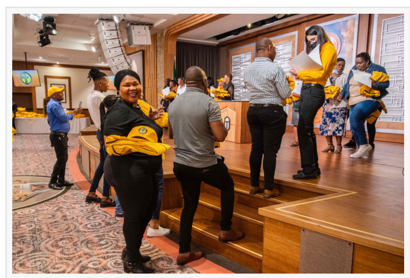
A graduate proudly displaying her joy as her name gets called to the stage