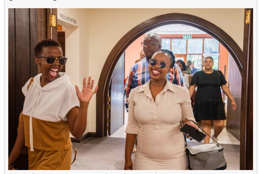
An educator arriving for the graduation

help them repair the damage. I was having a very difficult time with it. But since doing the Tools for Life, everything changed. I can already see the difference in the school."