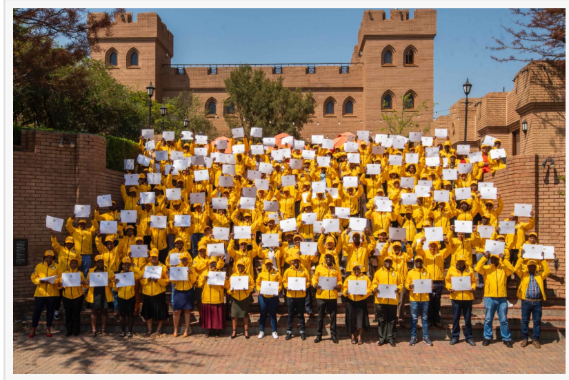
Graduates excitedly pose for a group shot after graduating

She further added, "I have to deal with all types of challenges with my students, their life challenges. We deal with students of all ages and by the time they come to my school, it is usually because they have had a very difficult childhood and now we have to