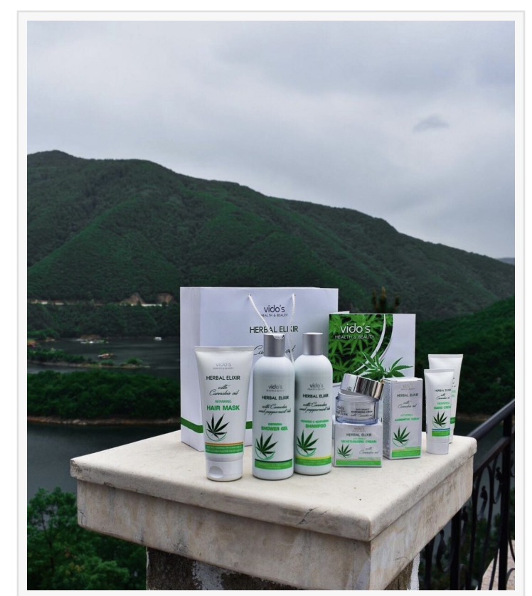
Herbal Skincare Elixirs from Vido's Health & Beauty USA

generation," they said. "HSO also moderates oil production and treats atopic dermatitis because it contains omega-6 and omega-3 fatty acids."