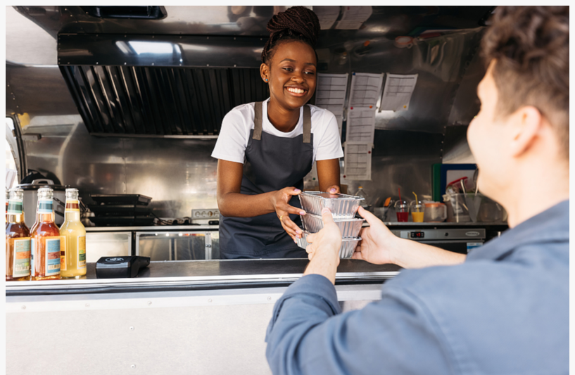
Food Truck Menu Launches New Service & Website

Food Truck Menu, the premier online menu solution for food truck business owners.