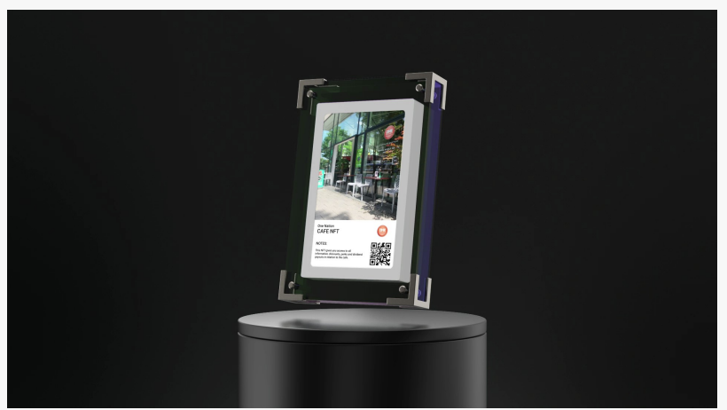
A preview of the One Nation Café NFT art