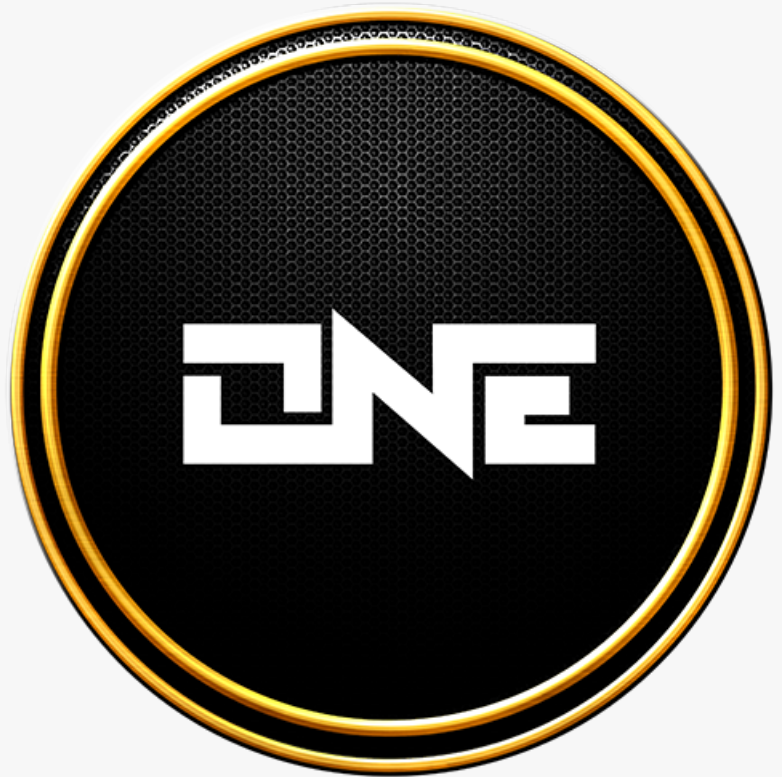
One Immortl Logo