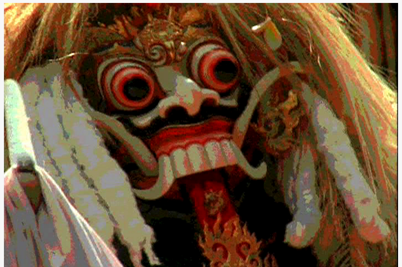
GV14 BALI, INDONESIA (RANGDA)