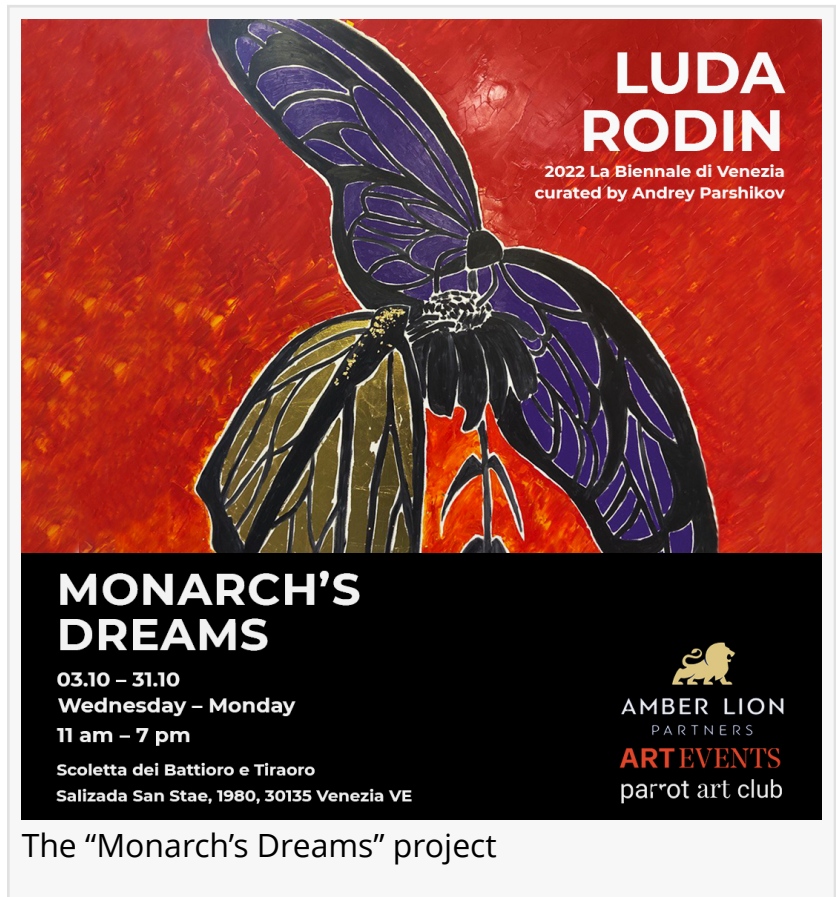
The "Monarch's Dreams" project

The "Monarch's Dreams" project is a painting research of how the fragility of ecosystems and systems in general, may lead to dissolution of social relationships and sound reference points and ways. The narrative of this exhibition is set on the problem of the extinction of Monarch butterflies. Their seemingly insignificant role in the ecosystem may soon play a cruel joke on humanity, creating a critical imbalance if the monarchs disappear. This tragic counterpoint is used by the artist to further develop a metaphor for the fragility of various complex systems, which may be destroyed if even the least important link were to be removed.