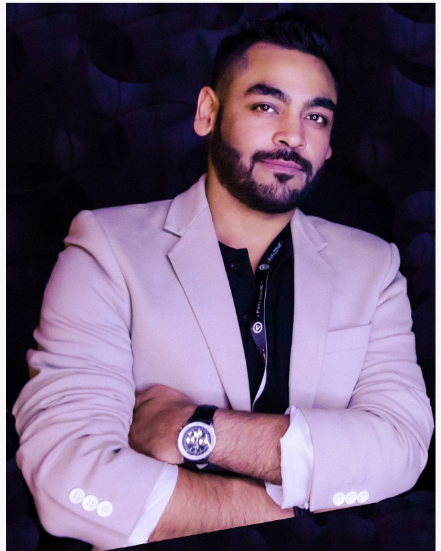
Managing Director & Artist Manager

FAYAZONE enjoys the reputation of being a company that works with a deep sense of integrity. They strive to put the needs and requirements of their talents above everything else.