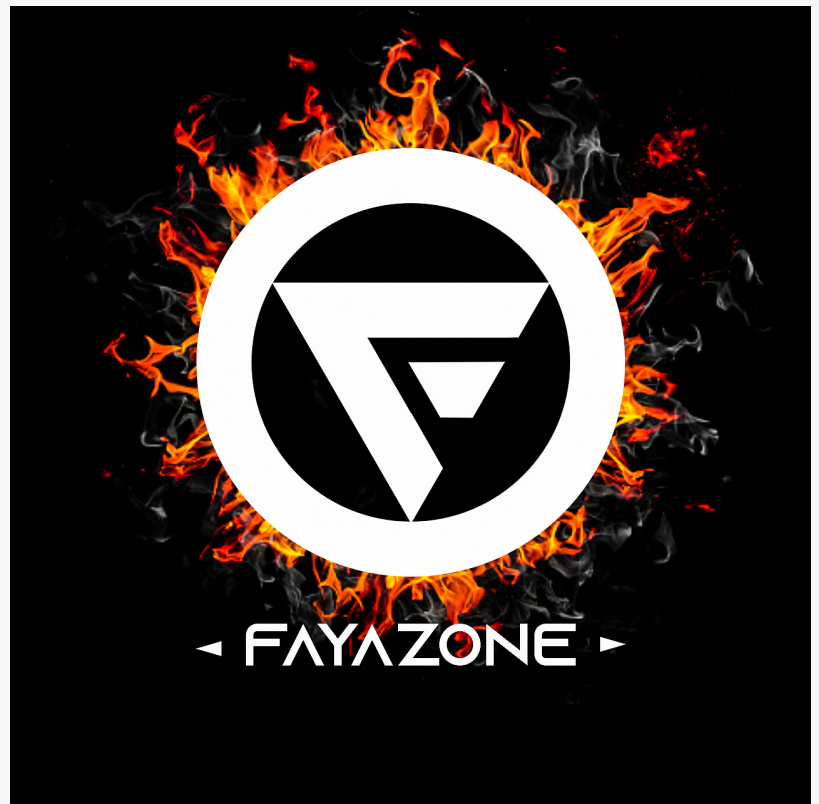
FAYAZONE Talent Management & Booking Agency Logo

FAYAZONE is known to be special in countless ways. One of which indicates that rather than just closing deals, they have continuously been cultivating strong connections with both talents and