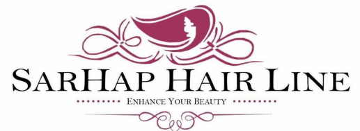
Sarhap Hair Line Logo

Sarhap Hair line is a supplier of 100% quality virgin hair. Our products include Lace wigs, Peruvian hair, processed Remy Human Hair, find more. Our quality is guaranteed at affordable prices. Check the honest reviews from our customers for more. We are here for you.