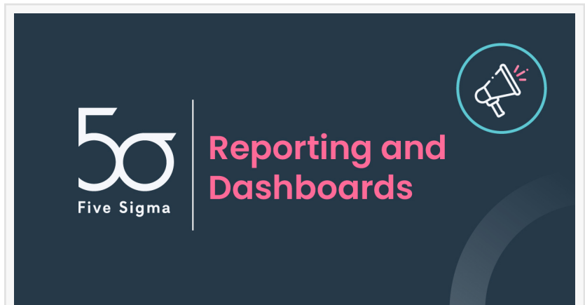
Reporting & Dashboards | Five Sigma SaaS Claims Management Solutions