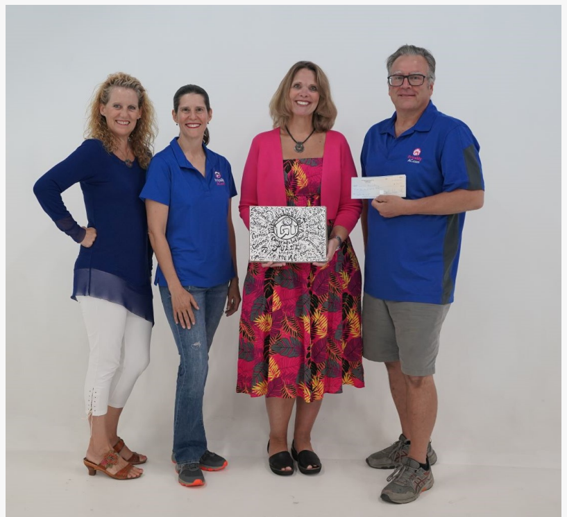
Making the World A Cooler Place Award