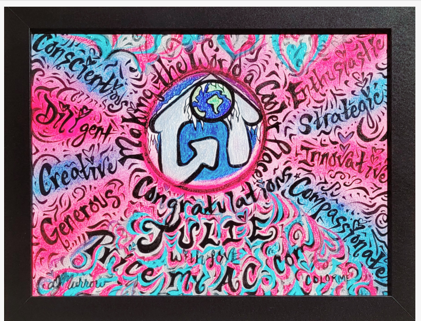
COLORME Cooler Place Award

In its first year, “Making the World a Cooler Place” award program recognized two citizens for their contributions and community service. In 2023, the program will grow to honor four citizens and present the awards on a quarterly basis. For more information about the awards, or how to nominate a potential award winner visit PriceMyAC.com’s Learning Center at: https://www.pricemyac.com/did-you-know/