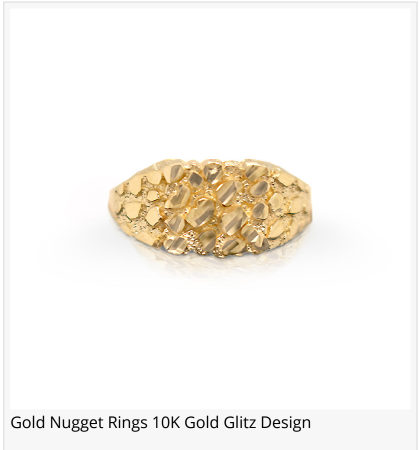
Gold Nugget Rings 10K Gold Glitz Design

Gold nugget jewelry has been popular for centuries, dating back to the California Gold Rush of