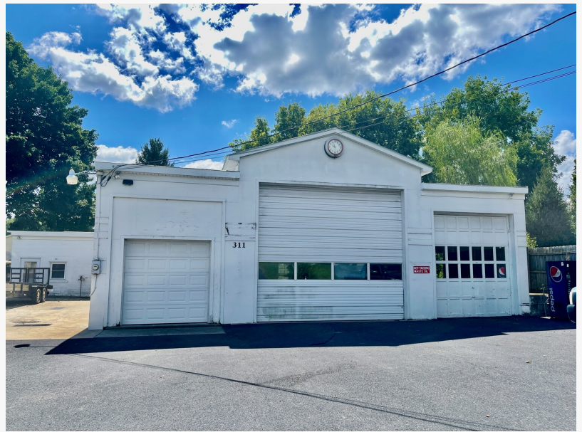
311 Mechanic St., Luray, VA 23835