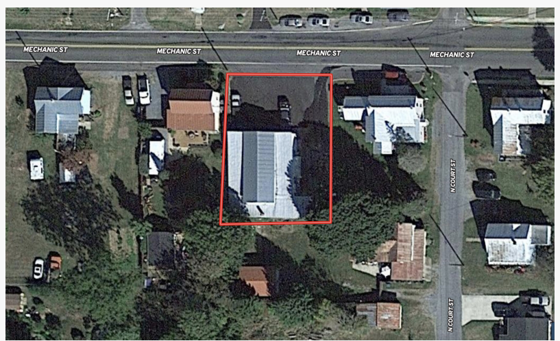
311 Mechanic St., Luray, VA 23835

The real estate auction is open to the public. Brokers are reminded that pre-registration is required for compensation.