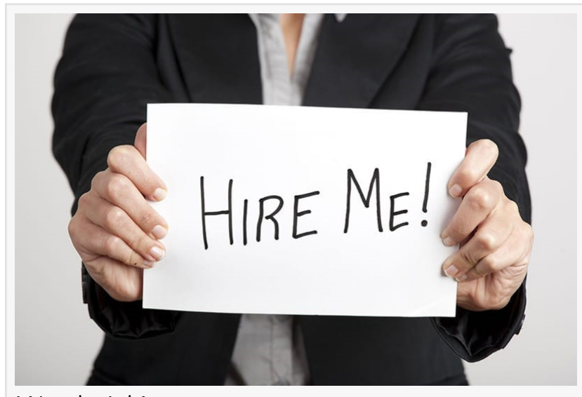
I Need a Job!