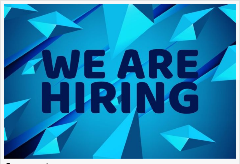
Come on In

ARNOLD, MO, UNITED STATES, September 28, 2022 / EINPresswire.com/ -- How many times in recent months have we driven or walked past a business, whether it be a restaurant, auto repair shop, dental office, big box store, or bakery to name a few displaying a 'Hiring' or 'Help Wanted' sign on the door or window? Even on major highways and byways, we see billboard verbiage pleading for employees. How many weeks have we read through a newspaper and