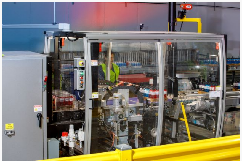
Automated systems enable mix and match production of beverage variety packs, along with automated shrink-wrapping and palletizing

The variety pack line assembles, shrink-wraps, and labels cases of beverages, either bottles or cans of varying sizes, incorporating custom wrap colors, product logos and graphics. The product moves along automated conveyance and material-handling equipment, rapidly assembling packaged cases of various flavors and SKU configurations, exiting through a sophisticated, heat shrink-wrap process which seals and secures each case of mixed beverages. A typical variety case is made up of 24 bottles/cans with 3 or 4 different flavors.