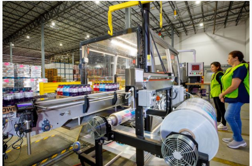
Bettaway's new variety pack line features advanced material handling systems that double its capacity for beverage pack production

SOUTH PLAINFIELD, NEW JERSEY, UNITED STATES, September 19, 2022 /EINPresswire.com/ -- Bettaway Supply Chain Services has expanded its Garden State beverage distribution and fulfillment services, launching a second, automated 'variety pack' processing line for assembly and fulfillment of beverage product orders.