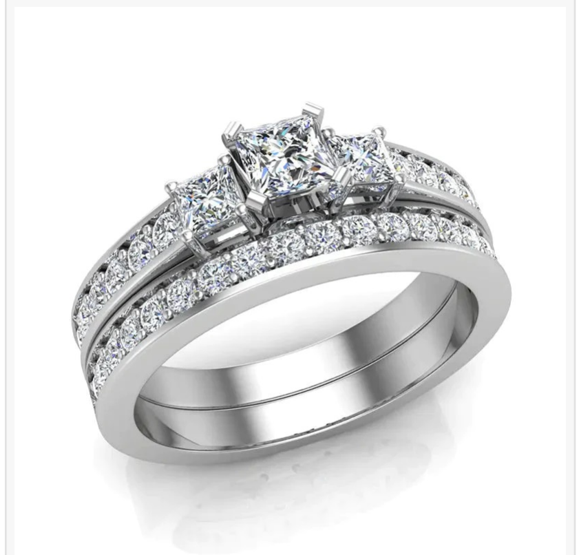
Past, Present, Future Princess Cut Three Stone Wedding Ring Set