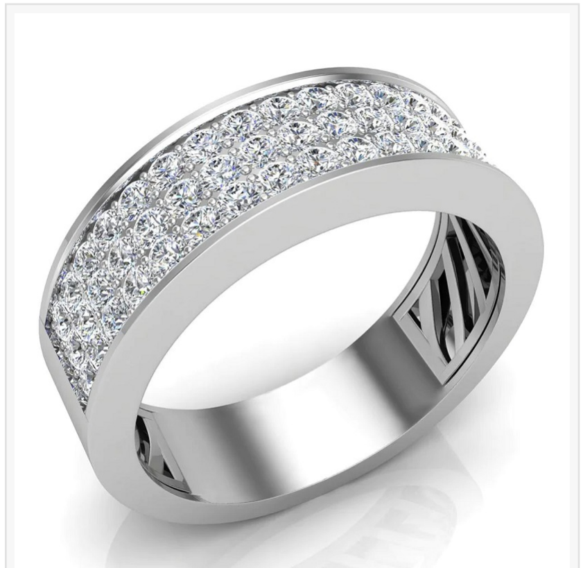
Mens Wedding bands Three-row Half-way Eternity Ring White Gold

When shopping for your own wedding band, it is important to keep in mind the long history behind this tradition. Whether you choose a classic gold band or something more modern, your wedding band will be a symbol of your