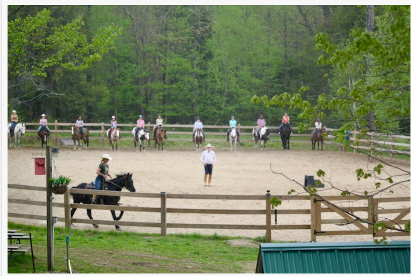
Classes held outdoors in the riding ring, with indoor options in inclement weather

The ranch has recently added six new horses to its stable. Boone and Falcon are a pair of 5- and 7-year-old Percheron/Welsh cross-draft horses purchased to be trained for riding as well as horse-drawn wagon and sleigh