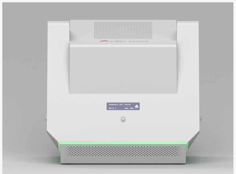
Killer Ernst air purifier with HyTHERMO