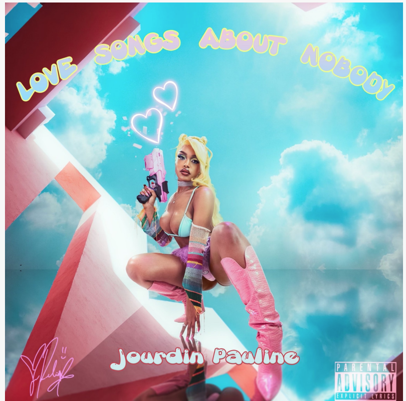
Jourdin Pauline, "Love Songs About Nobody" - cover