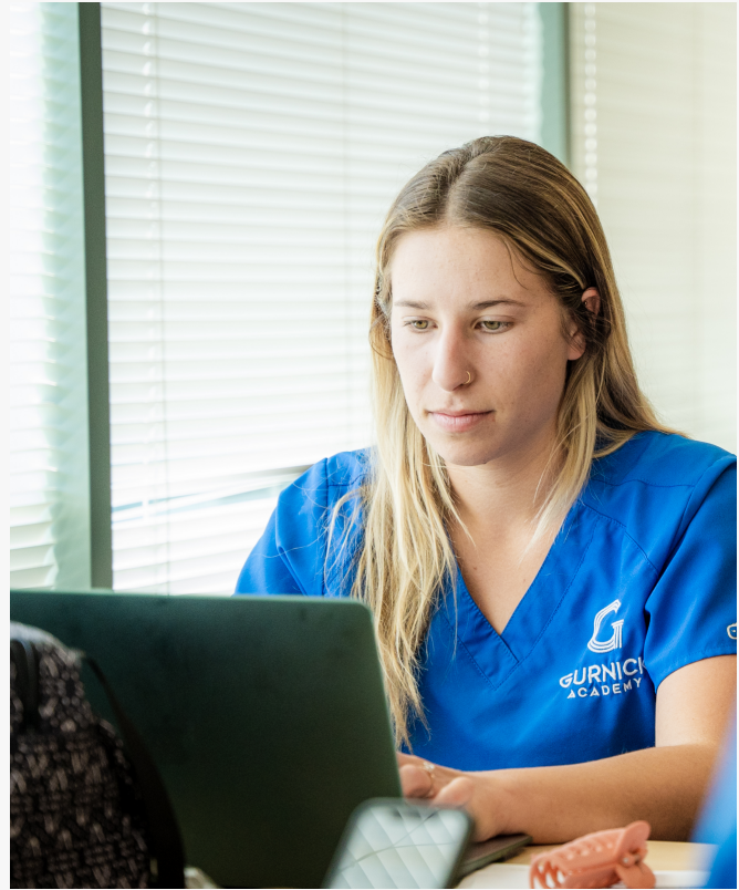
Gurnick Academy of Medical Arts' upcoming BSN-MSN pathway curriculum is designed with an emphasis on nursing scholarship in mind.

Gurnick Academy of Medical Arts is a private, post-secondary academy offering quality allied healthcare