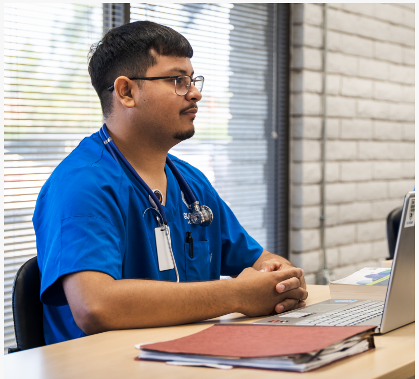
Gurnick Academy of Medical Arts' new Master of Science in Nursing (MSN) program is now enrolling with core courses starting on Oct. 17, 2022.