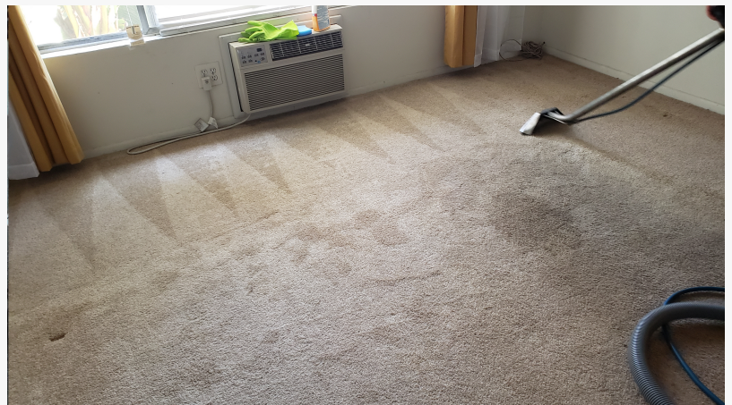
Apartment Carpet Cleaning